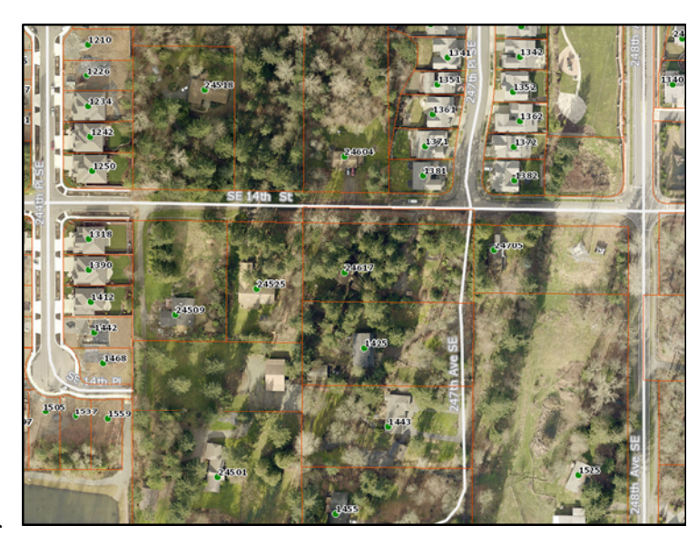
Report and Exhibits can be found here:

Description of proposal: Request to subdivide three developed properties with three existing single-family residences that total 3.24 acres located in the R-4 zone into a total of 12 single family lots. The existing residences will be removed. Due to site topography, approximately 6,700 cubic yards of cut and 7,700 cubic yards of fill are proposed to adjust the site's grade as needed to accommodate building pads and necessary infrastructure. The project proposal requires Preliminary Plat approval by the City of Sammamish. copy of the Staff https://spaces.hightail.com/space/znzUEwh3uW.