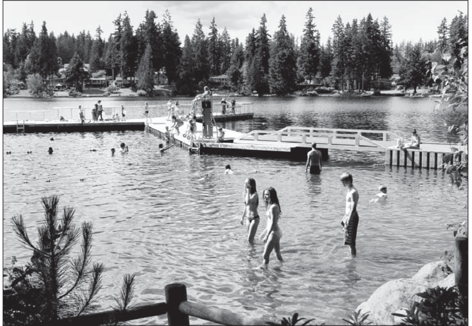
A lazy Tuesday afternoon at Pine Lake Park

Want to swim, or watch your kids swim? Come on down to the beach, or walk out on the new array of docks. Lifeguards are on duty from noon to 7 p.m. every day until Sept. 1!