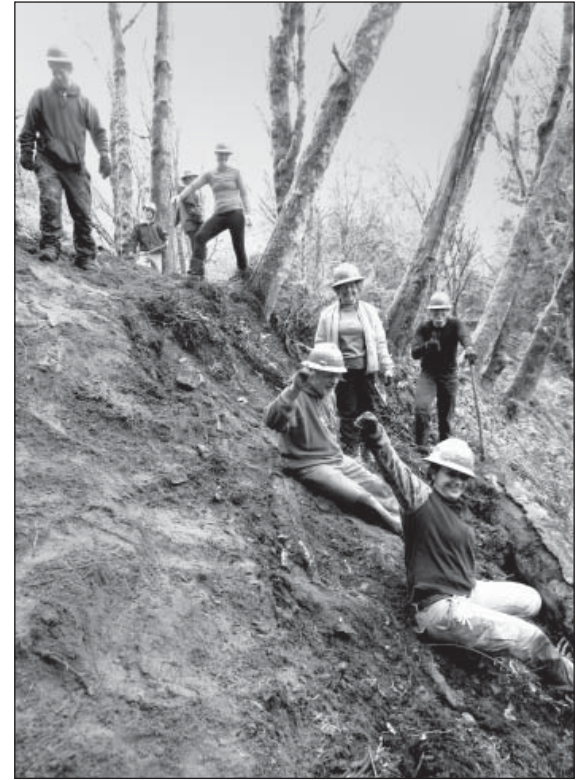
Volunteers on a steep slope at Evans Creek Preserve.

The latest phase of volunteer work is just wrapping up, but there will be more! To sign up, just go to www.wta.org/volunteer/trail-work-parties .