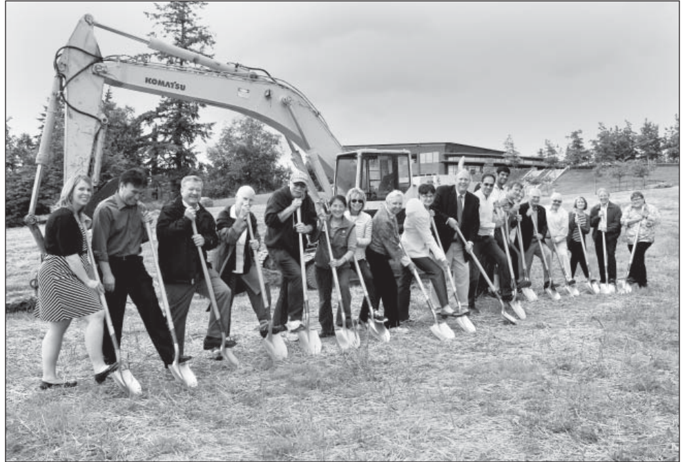
City of Sammamish and YMCA officials join staffers and other stakeholders during the ceremonial groundbreaking on June 12 for the new Community and Aquatic Center.