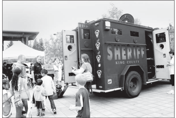
Kids visit with police officers at City Hall Plaza.

Those interested in organizing their own neighborhood gathering as part of "National Night Out" should go to sammamishcitizencorps.com and register.