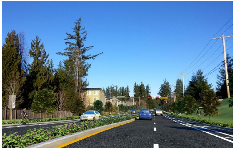
Rendering of future roadway between 242nd Ave SE to 247th PI SE