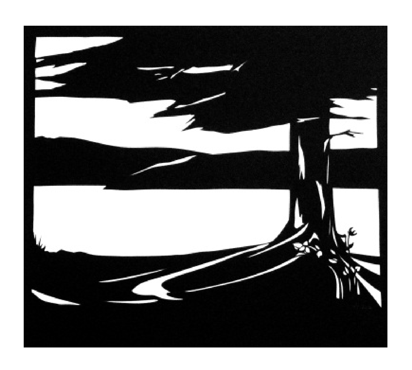
Near the Shore Located at City Hall in the secured area. 2012