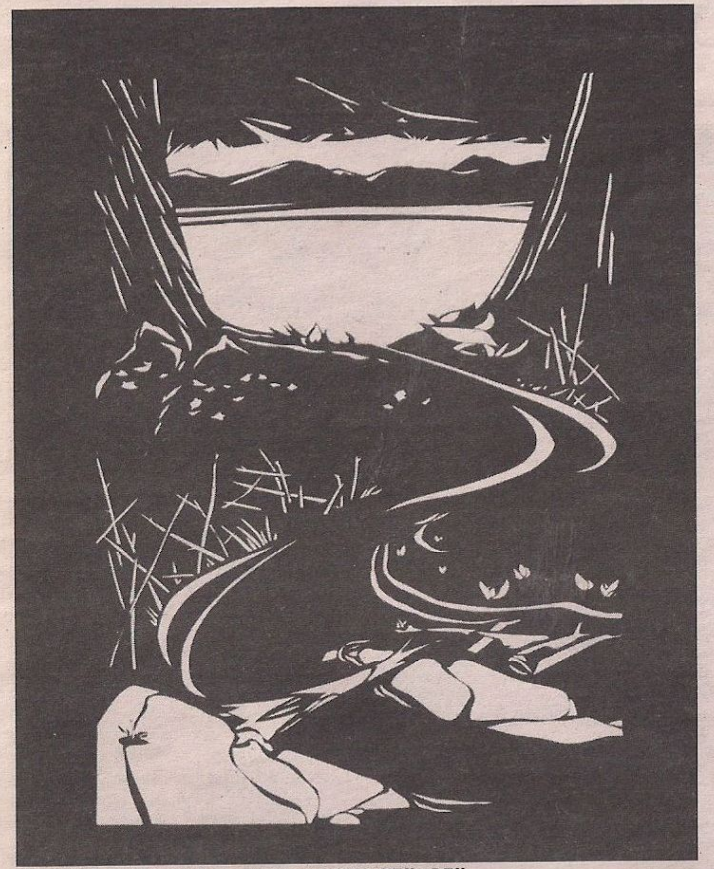
"Winding Wood" papercut 2012 35"x25"