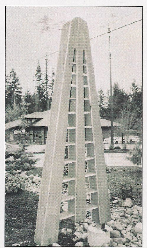
"11 Steps; Ladder 83" at S.E. 32nd Way and Issaquah-Pine Lake Rd.

been repurposed, carefully sculpted, and placed in the middle of three roundabouts.