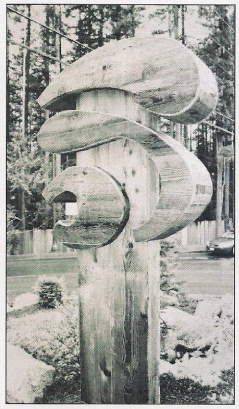
"Forms in Flight" at 216th Ave. N.E. and Inglewood Hill Road

With more weathered wood still available from the old red barn, and more roundabouts to adorn, the Arts Commission hopes to install additional sculptures later this year.