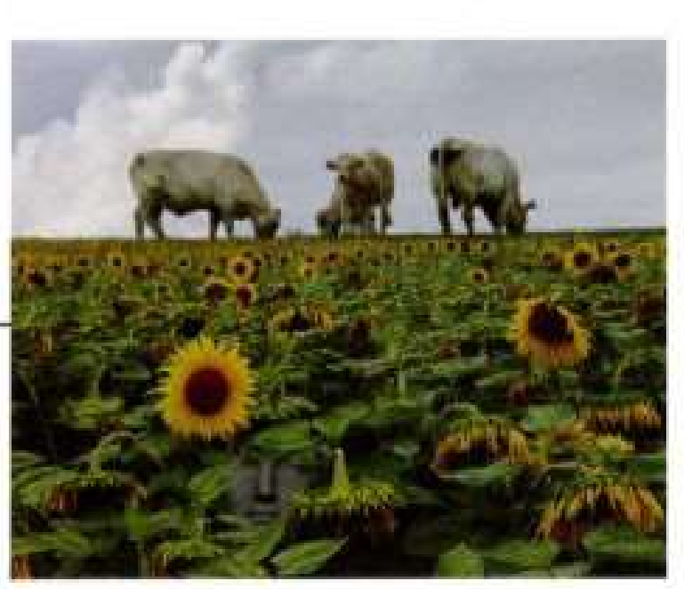
KENT VAN SLYKE