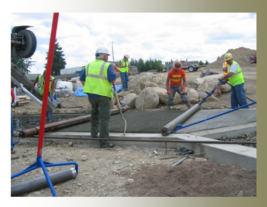
"As Sammamish Commons becomes a gathering place for the community, our residents will absorb new ideas for softening their own impact on the environment."

The city leaders wanted the Sammamish Commons project to be a LEED showcase for citizens, builders and developers who visit the building every day. For this reason, grasscrete, porous asphalt, porous concrete, regular concrete, regular asphalt unit pavers, and gravel trails were used at the site to increase awareness of alternative materials that can reduce the amount of impervious surface.