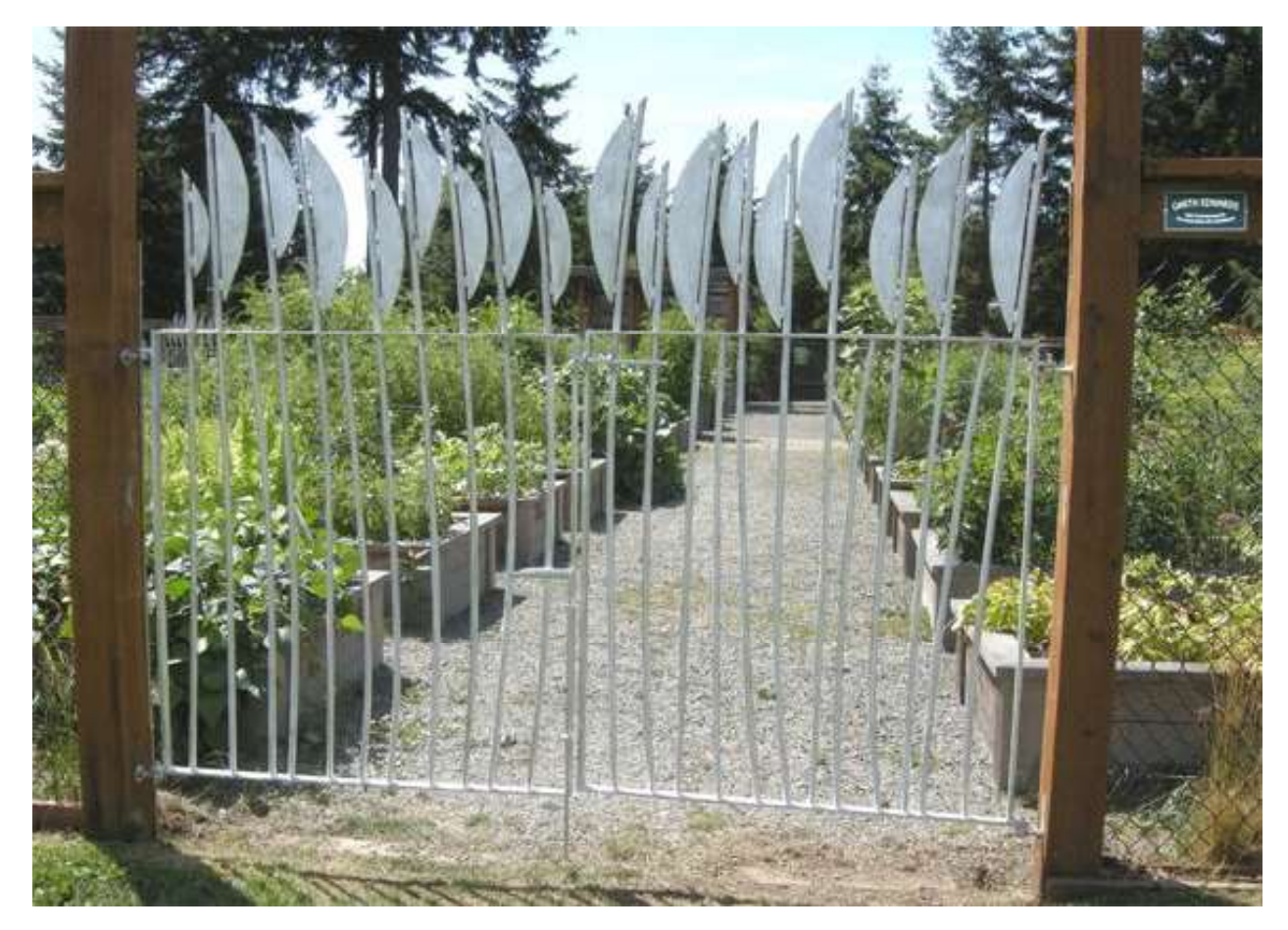
Garden Gates by Garth Edwards 2014