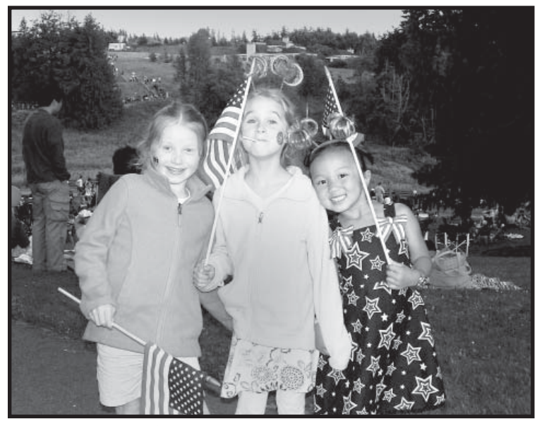
Fun and fireworks at the Fourth on the Plateau!

(Keep reading this city newsletter for times and dates)