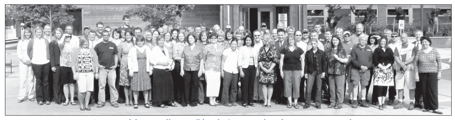
Sammamish has a small city staff, but they're eager to hear from 11,000 new residents.