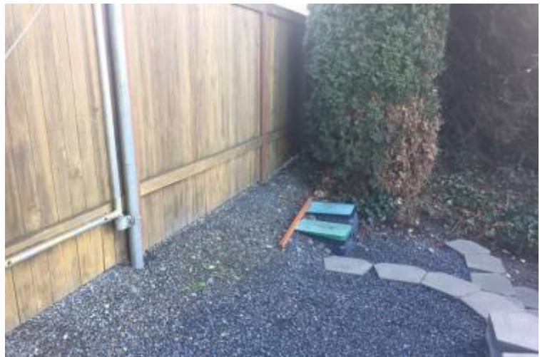
The waterline box is west and immediately adjacent to the trail.

Mitigation Strategy: The plans show that the CG line is not consistent in its width from the guardrail suggesting that there is room for variation. We request that the waterline be able to remain in its current location.