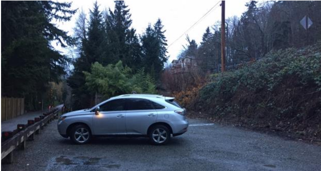
Parking area view facing north with a view of the blackberry bush hill.