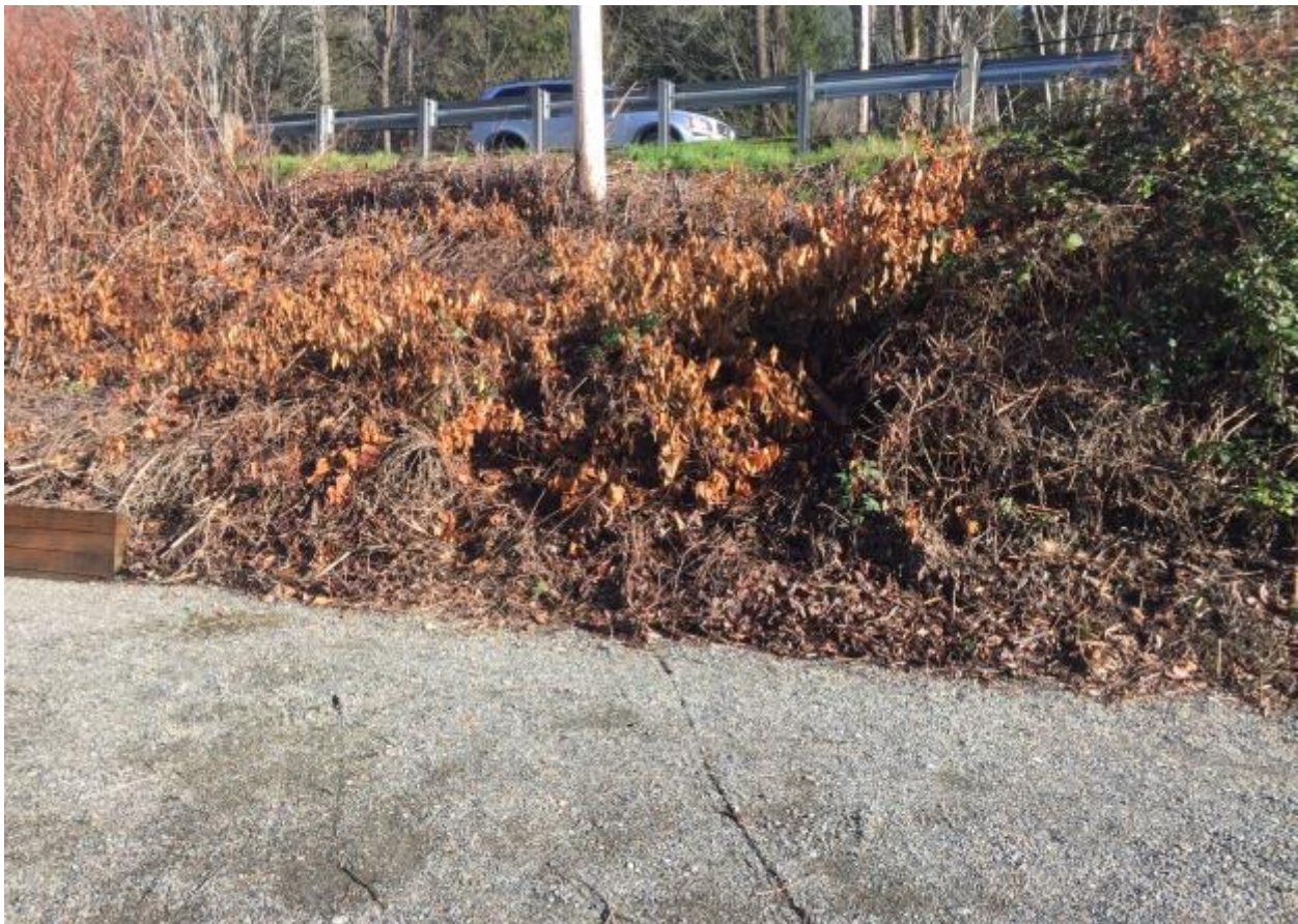
Section of the blackberry bush hill, with the Parkway above.