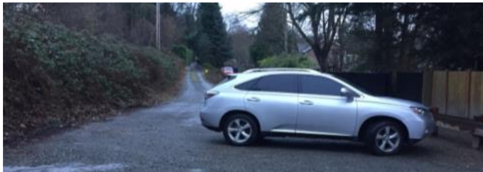
Parking area view facing south

Mitigation Strategy: One side of the parking area is deeply covered with blackberry bushes. If the County limits the location of the guardrail by 1-2 feet and clears out the blackberry bushes and installs a structural earth wall, we may be able to recover the needed space.