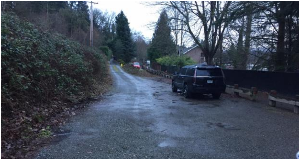
The parking area is small and extremely limited.

Additionally, as space is limited in this area we need a clear understanding of how we will access our property during construction.