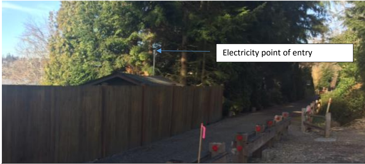
View of the shed from the east, trail view.