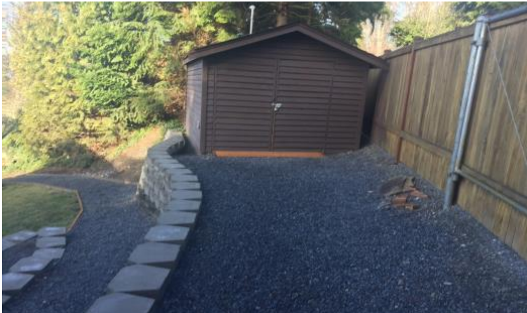
View of the shed west of the trail, inside the fence line.

Mitigation Strategy: The plans show that the CG line is not consistent in its width from the guardrail suggesting that there is room for variation. We request that the shed be able to remain in its current location.