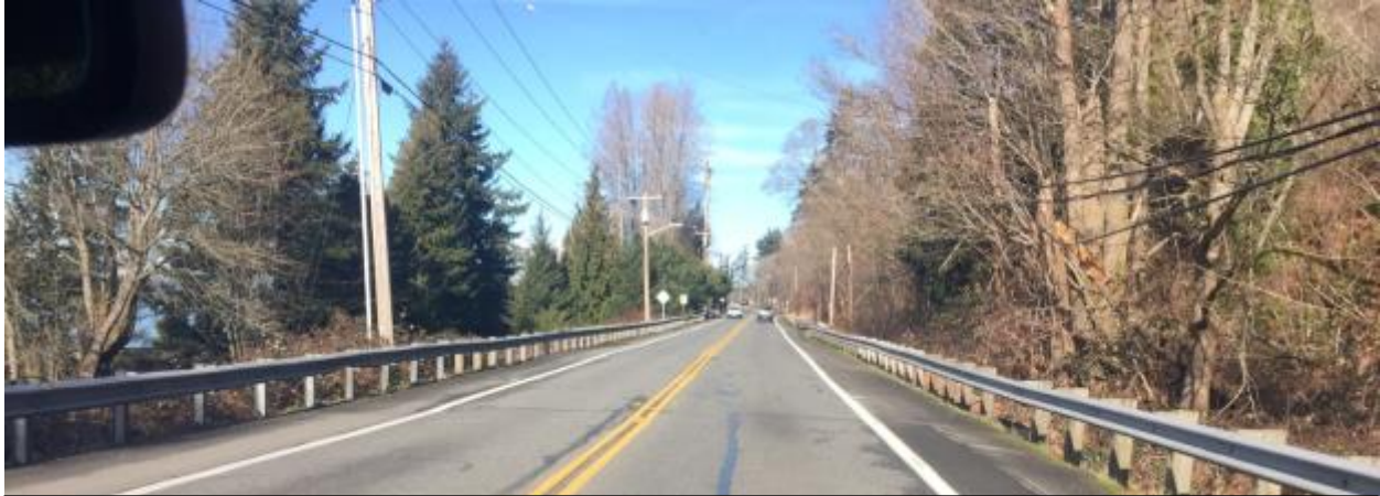
View of the Parkway facing north directly above our property, shoulders are not wide enough for a vehicle.